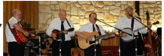
Entertainment by the NAZARENE BLUEGRASS BAND