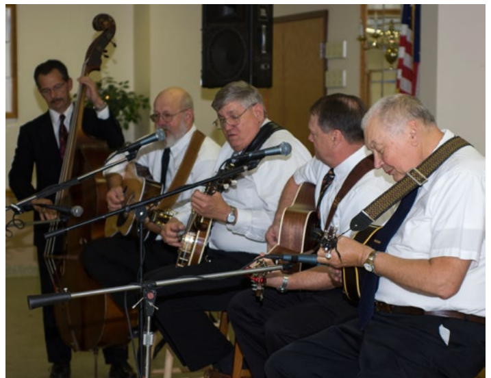
Above, the Nazarene Bluegrass Band performs as the evening's entertainment. Left, many of the assembled enjoyed turkey and ham as part of the Ladies Night banquet.