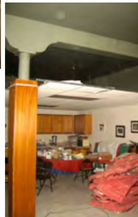
Left: WM Carl Lee attacks the old walls. Above: The old drop ceiling comes down. Left: The ceiling beam and column is uncovered.