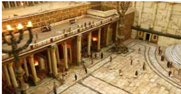
Special Thanks to Past Grand Master Jack Biggs for supplying this article and photo.