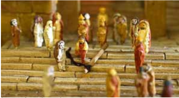
ings of ancient times.

He then started to construct the amazing 1:100 scale model, which is now housed in a huge building in his back garden. "Everything is made by hand. I cut plywood frames for the walls and buildings and all the clay bricks and tiles were baked in the oven then stuck together," he said.