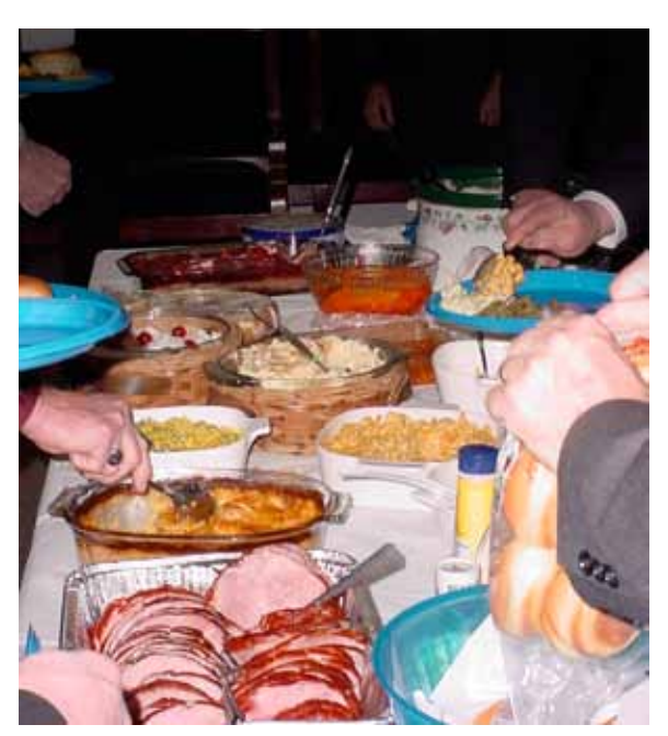
The typical section of tasty treats available at one of Stephenson Lodge's Installation Dinners. This is a photograph of last year's selection.

Stephenson Lodge will be holding a covered dish installation dinner at 6:00 pm on January 4th, 2006. The dinner is open to all and is free for all members and guests. Please try to bring a covered dish of your choice. The lodge will be furnishing ham as the main meat for the dinner. The dinner will be held upstairs in the Lodge room of Stephenson Lodge. Installation will be immediately after the dinner at 7:30 pm.