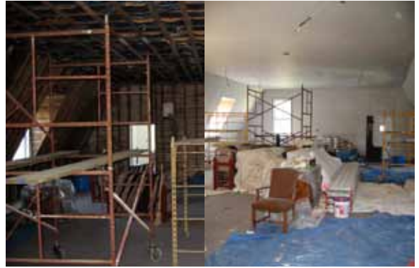
Progress over the Summer months.

Sincerely and fraternally, Duane Duncan, WM