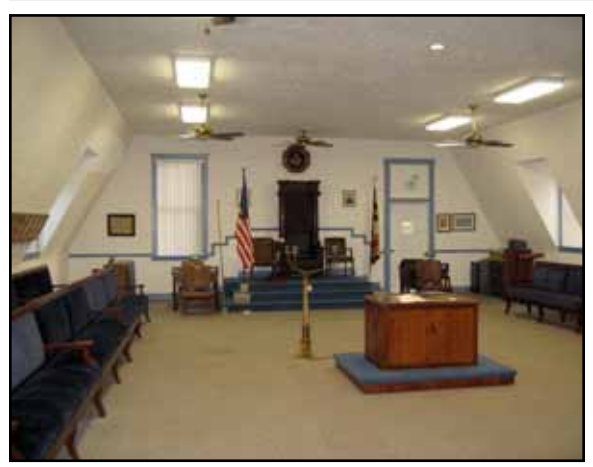
The new interior of the lodge has been completely redone and looks great. Thanks to all of the hard work done over the Summer.